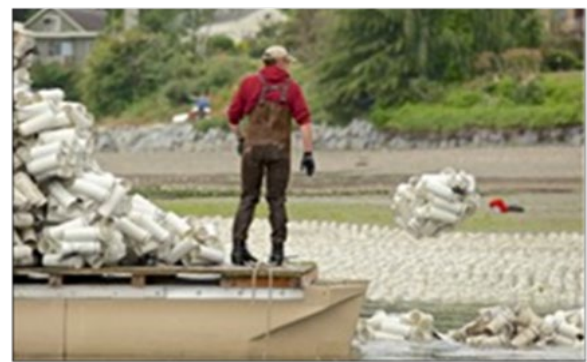
19 Figure 4: New Geoduck Installation, Eld Inlet, South Puget Sound (2013)

20 21 22 23 24 25 57. The same intertidal areas and inland bays that support shellfish aquaculture are 26 also home to numerous wildlife species, including threatened and endangered species. This 27