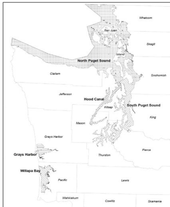
25 Washington Inland Waters in 26 U.S. Army Corps, Programmatic Biological Assessment (2015)

4 52. Shellfish, including oysters, clams (including geoducks), and mussels, have been 5 harvested and grown in Washington for over 150 years, but cultivation has expanded significantly 6 since the Corps' initial issuance of NWP 48 in 2007, and continued maintenance of the NWP 48 7 program until it was vacated in 2020. Today, industrial shellfish aquaculture exist throughout 8 Washington's coast and intertidal areas, including Willapa Bay, Grays Harbor, Hood Canal, and 9 Puget Sound. In 2015, commercial shellfish aquaculture occupied one-quarter of the state's total 10 shoreline, roughly 50,000 shoreline acres. Today, this number has increased due to the Corps' 11 issuance of the 2017 and 2021 NWP 48. According to the Corps' estimates, commercial shellfish 12 operations authorized under the 2017 NWP 48 cover 72,000 coastal acres, covering roughly one- 13 third of Washington's total shoreline.