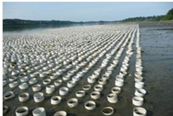
17 Figure 2: Geoduck Tubes, Totten Inlet, South Puget Sound (2008)