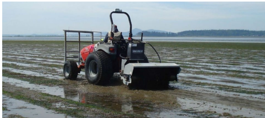
21 Figure 6: Tractor with Street Sweeper, Willapa Bay

9 73. The Corps has recognized that these impacts are continuous for the permit period 10 authorizing aquaculture activities, because there is often no return to the prior substrate and 11 habitat conditions; new equipment is placed shortly after harvest of the prior crop, and equipment 12 use occurs in all regions of Washington. Corps, PBA (2015). Thus, while eelgrass may recover or 13 re-colonize areas after shellfish aquaculture has ceased (recovery estimated to take about five 14 years in Washington), the continuous nature of production makes this impossible.