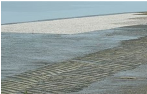
16 Figure 1: Oyster Bags & Geoduck Tubes, Totten Inlet, South Puget Sound (2009)

1 kind of support (“off-bottom culture”), often using plastic gear like polyvinyl chloride (PVC) and 2 high-density polyethylene (HDPE). Oysters may be grown using bottom culture; long lines 3 (oysters suspended on nylon ropes strung on stakes in rows in tidal bed); rack and bag culture 4 (plastic net bags hold oysters, rack suspends off ground, including emerging “flip bag” 5 technique); or stake culture (oyster attached to stakes in tidal bed). Clams are also grown with 6 bottom culture, often with anti-predator netting, and geoducks are grown inside PCV tubes 7 inserted into the tidal bed (at a rate of 42,000 tubes per acre), which are then covered with the 8 anti-predator netting.