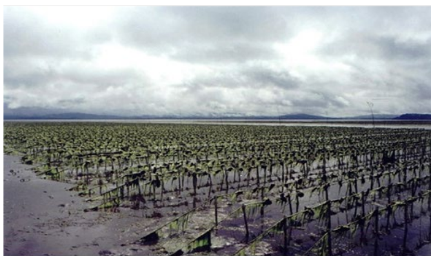
18 Figure 3: Oyster Long Lines, Willapa Bay